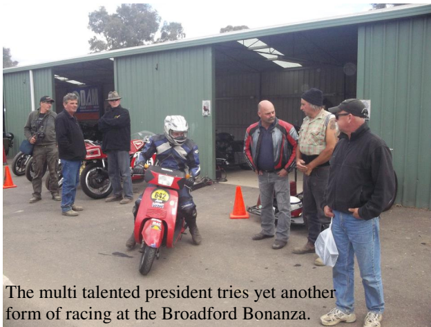
The multi talented president tries yet another form of racing at the Broadford Bonanza.

The Vic Titles have once again been run and what a meeting it's growing into. A few years back, interest and entries were waning and the club tried a few different strategies to redress that. We firstly invited the BEARS to join, then the Formula 2 sidecars. Now, numbers are such that we're creating new races for classes like P4 sidecars, FE 250's and 350's. With the surge in 125 entries, they may end up with their own race soon as well.