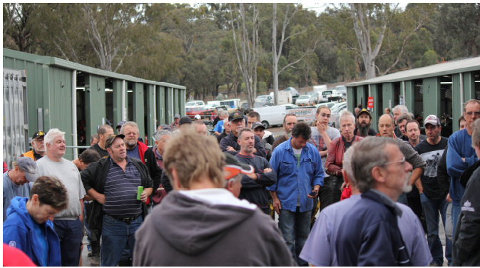
Above and below the riders and officials gather early Saturday morning for the Riders Briefing.