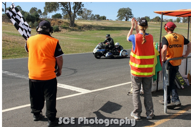
Great work as always by our volunteers