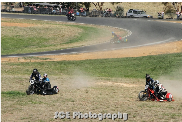
Oh Dear!.... Three sidecars and one corner just doesn't add up