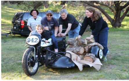
Great use for a Norton Sidecar!!!