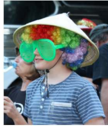
Paddy's best headgear in the hat competition