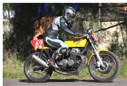
Stacey Heaney's best time of 49.7 is 4.5 secs ahead of the fastest lady driver on record!