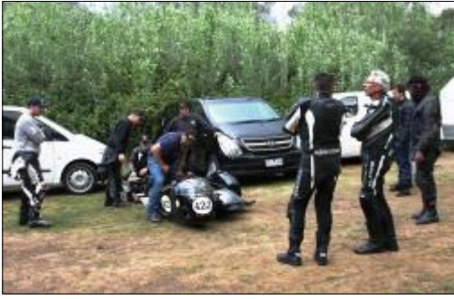
mmmm. . . any suggestions anyone?