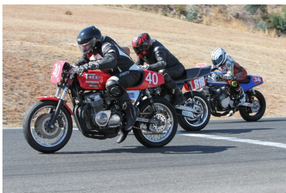
Unlimited Post Classic and Forgotten Era make a start. Below: Harley Vs Indian Handshifters waiting at the dummy grid