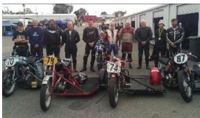
Various Larges and their Passengers