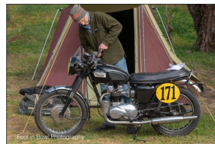
Paul Leys doing that final adjustment