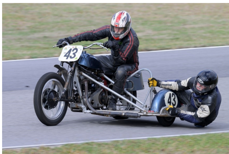
#43 Ditchy and Tiny