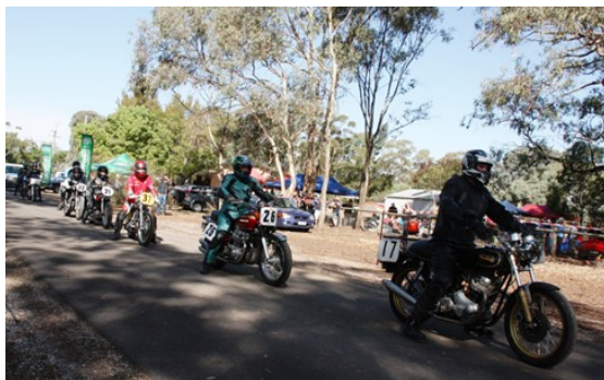
Line-up for the sprint start