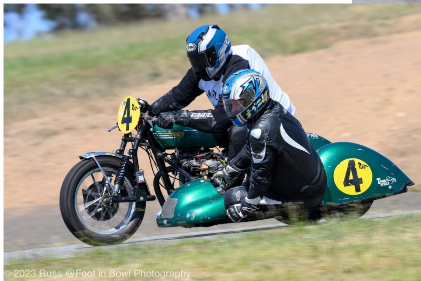
Above and Below: Period 4 & 5 sidecar action.